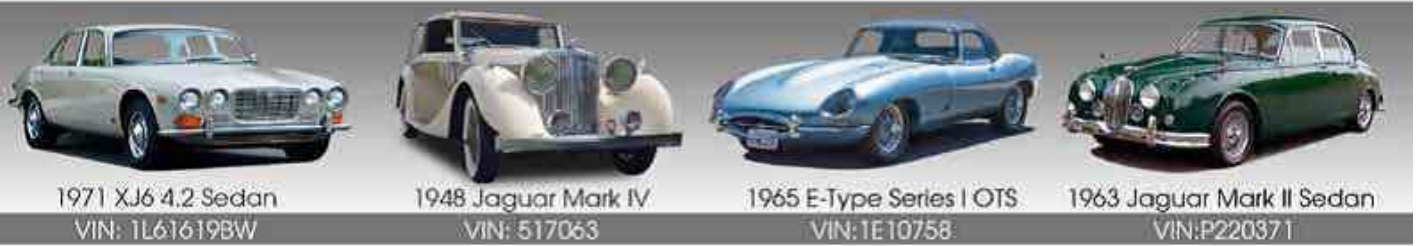
1971 XJ6 4.2 Sedan VIN: 1L61619BW