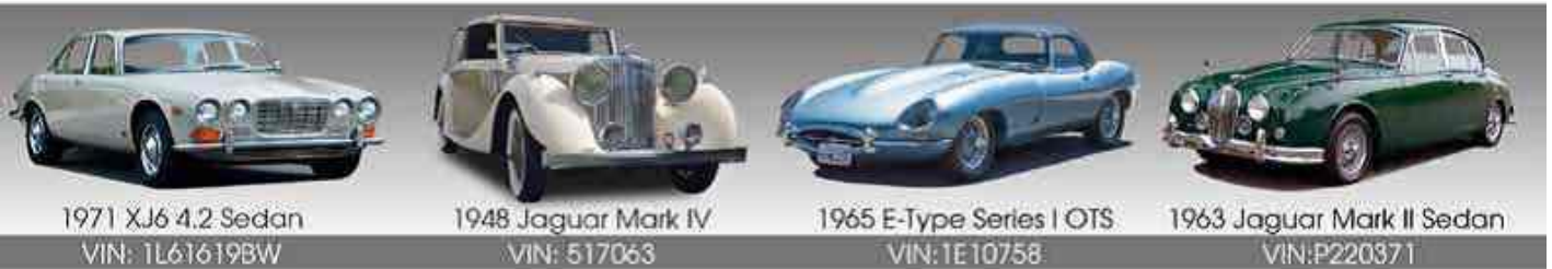
1971 XJ6 4.2 Sedan