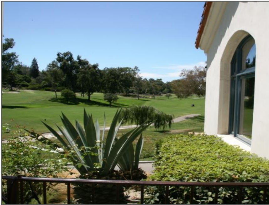
Rancho Santa Fe Golf Club