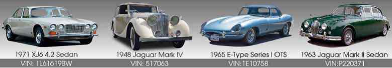
1971 XJ6 4.2 Sedan VIN: 1L6T619BW