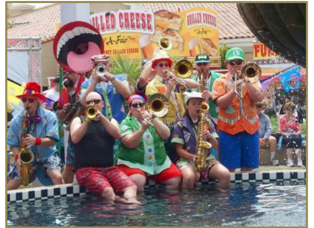
Glad they're not playing electric guitars!