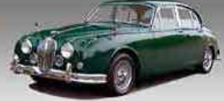
1963 Jaguar Mark II Sedan VIN: P220371

To providing unparalleled dedication, service & experiences for collectors for over 30 years,