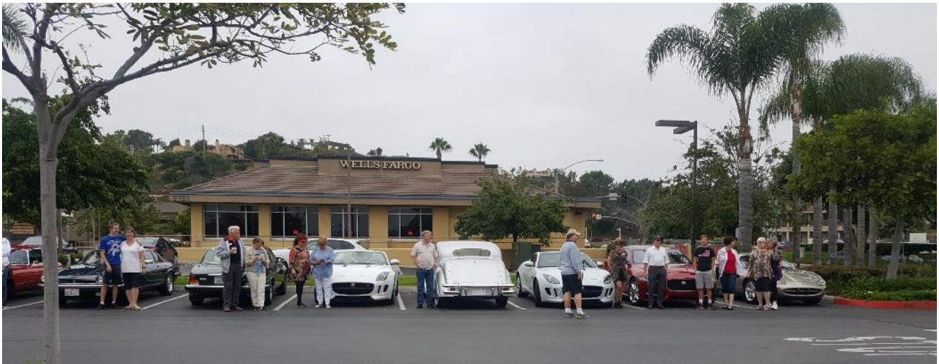
The Pre-take-off meeting - group picture in the Gelson's grocery store parking lot. You can tell how close of attention everyone is paying to the camera.

This year we motorcaded onto the fair-grounds through the Solana Gate, on the northwest side of the grounds, where they staged us in two long lines - the Jags next to our "fairmates", the Over the Hill Gang car club. The entry route to the show area was no less circuitous than in previous years, but it worked. The main benefit was that there was no automatic gate that had to be manned twice while the cars entered the grounds at two separate times.