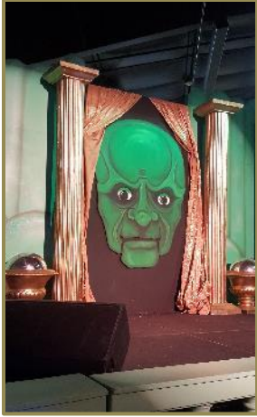
The Great Oz holding court