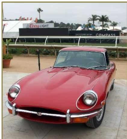
The Proctors E-Type