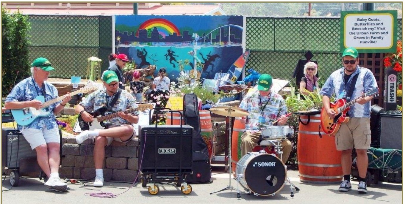
See you next year!