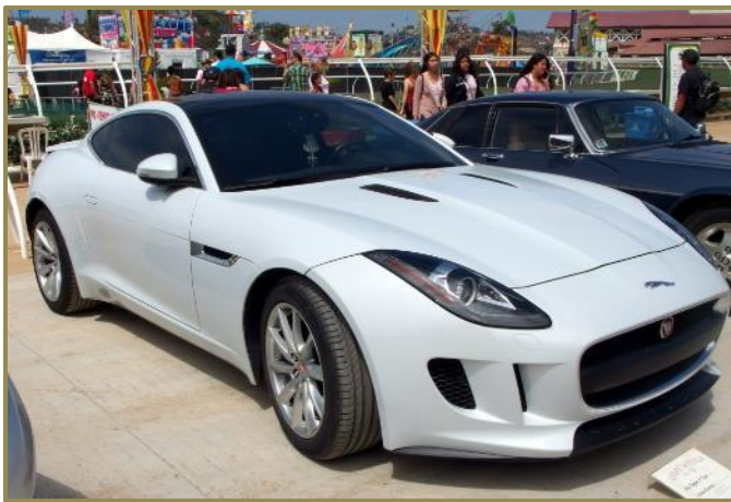
Diane Bauman's F-Type