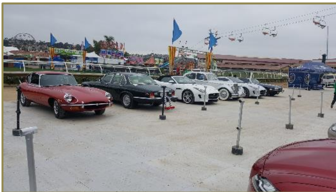
Staging lines pre-Fairgrounds parking