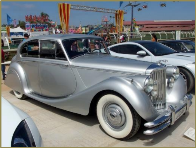
The Putnam's Mark V