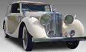
1948 Jaguar Mark IV VIN: 517063