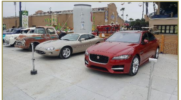
Fairgrounds parking and set up at the car show

The winner of the People's Choice Award for the day was a 1932 Ford (not shown). We got our picture taken as a group with our souvenir posters. Then at 3:00 we had to move our cars out of the show area. As in years past, several of us left for points outside of the fairgrounds, while several others of us stayed into the evening to tour the exhibits, listen to music, shop, and eat more of that all too tempting fair food.