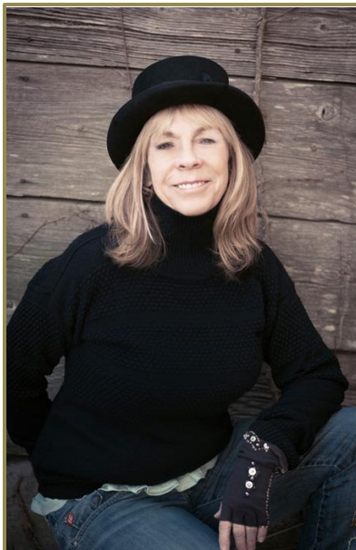
Ricki Lee Jones - Solid Gold artist for the day