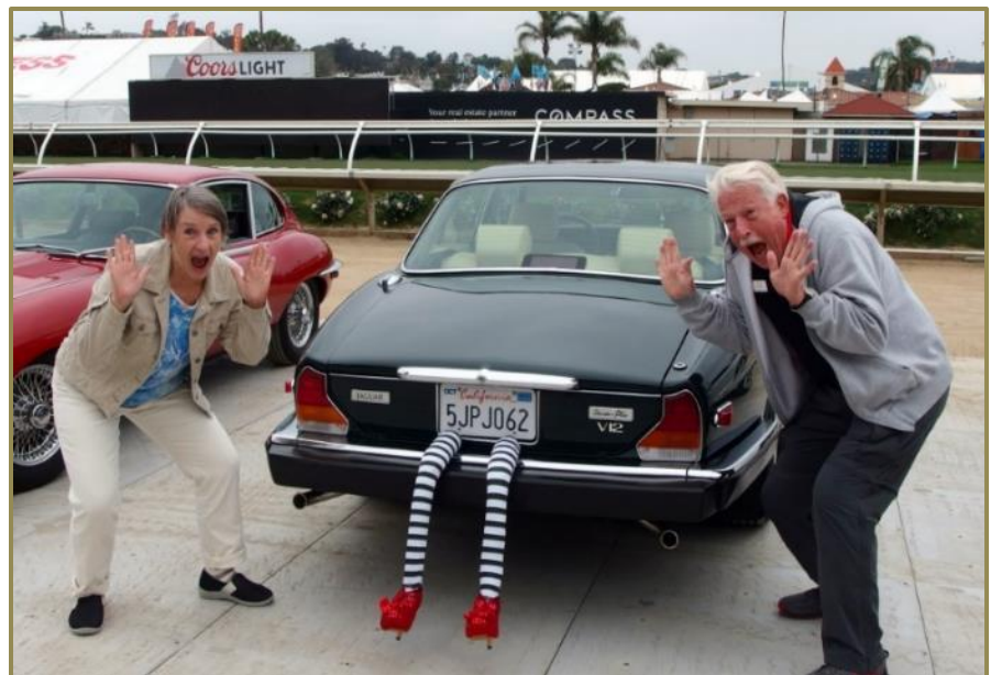
The Wicked Witch of the West fared no better at the hands of the Novak's than she did in the land of Oz.