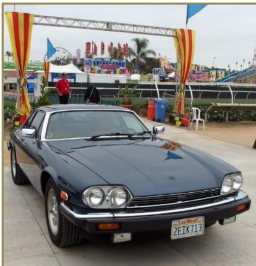
The Allen's XJ-S