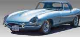
1965 E-Type Series I OTS VIN: TE10758