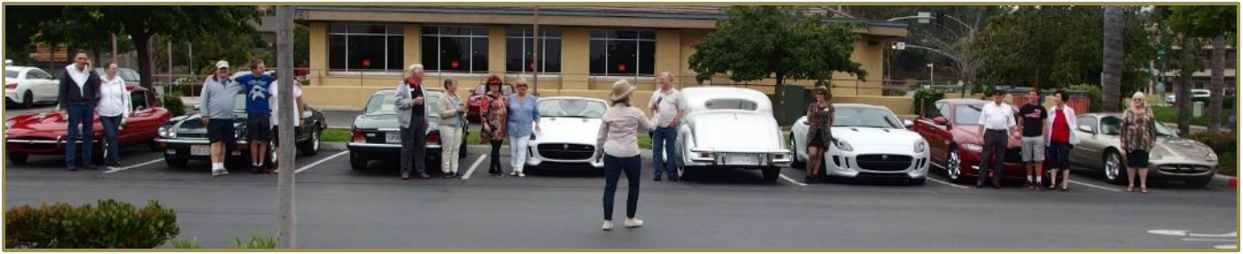
SDJC members and their cats get ready for the festivities!