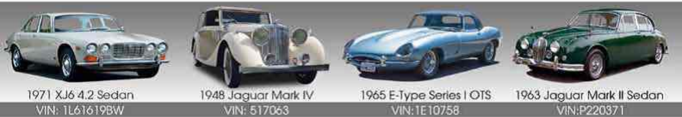
1971 XJ6 4.2 Sedan VIN: 1L61619BW