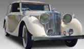
1948 Jaguar Mark IV VIN: 517063