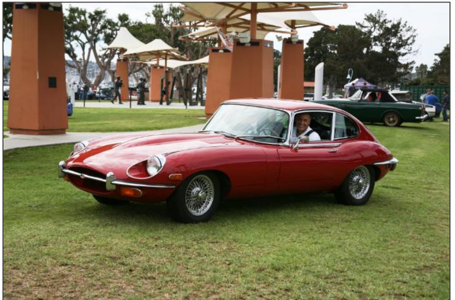
Bob & Ali Proctor and their 1969 E-Type 2+2