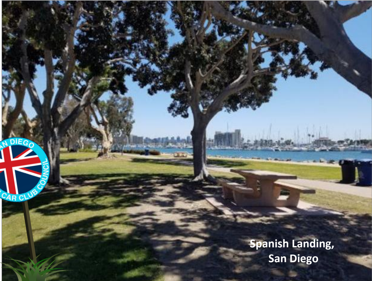
Spanish Landing, San Diego

News from the SAN DIEGO JAGUAR CLUB November 2018