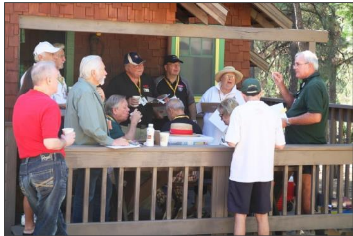
The judges meet

Editor's note: Remember when going out of town to print out a copy of the cover page of the most recent "Jaguar Tracks" and take it with you. When you find a good setting just snap a picture of yourselves holding up the cover page with a nice view of the scene behind you. And if you've got your Jag in the shot, even better. Then all you need to do when you get home is email the picture to chuckleuthen@cox.net along with a description of where you're at and I'll do the rest to feature it in a "Where in the Word" article!