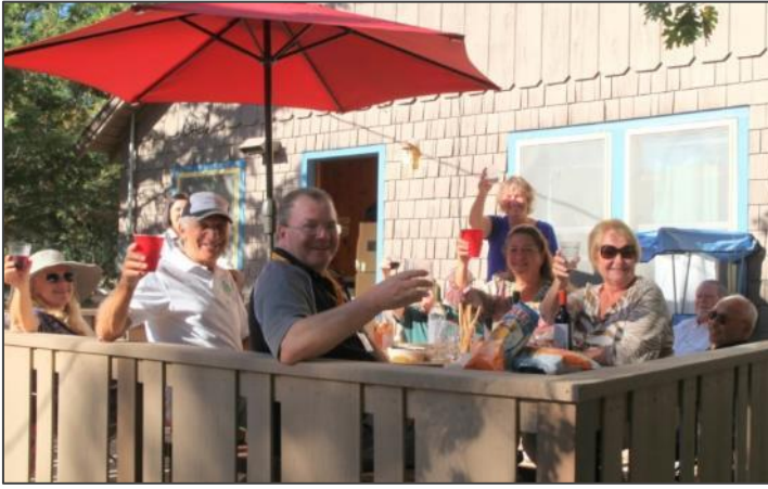
Libations upon arrival