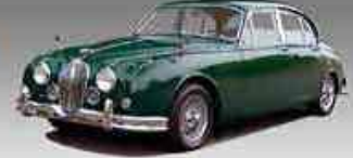
1963 Jaguar Mark II Sedan VIN: P220371

To providing unparalleled dedication, service & experiences for collectors for over 30 years,