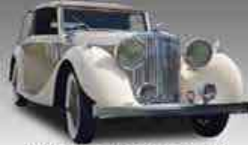
1948 Jaguar Mark IV VIN: 517063