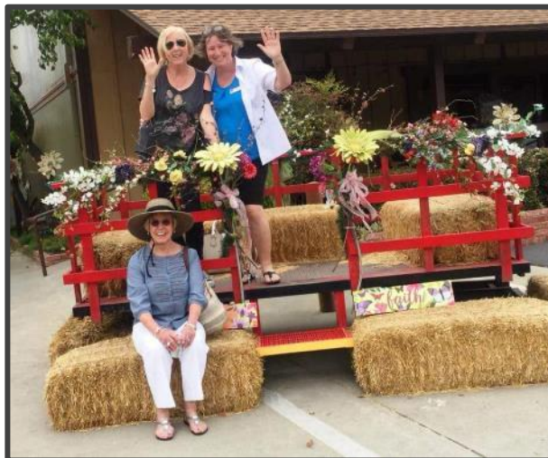
So long for now. See you all at the Member Celebration Luncheon!