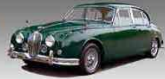
1963 Jaguar Mark II Sedan VIN: P220371

To providing unparalleled dedication, service & experiences for collectors for over 30 years,