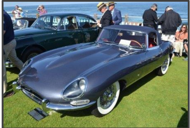
Tom Krefetz's 1961 XKE Roadster OBL