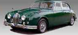
1963 Jaguar Mark II Sedan VIN: P220371

To providing unparalleled dedication, service & experiences for collectors for over 30 years,