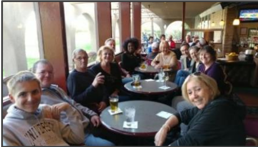
Saturday afternoon relaxation and cocktails looking out on the fairways and the mountains surrounding Anza-Borrego.