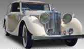
1948 Jaguar Mark IV VIN: 517063