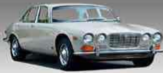
1971 XJ6 4.2 Sedan VIN: 1L61619BW