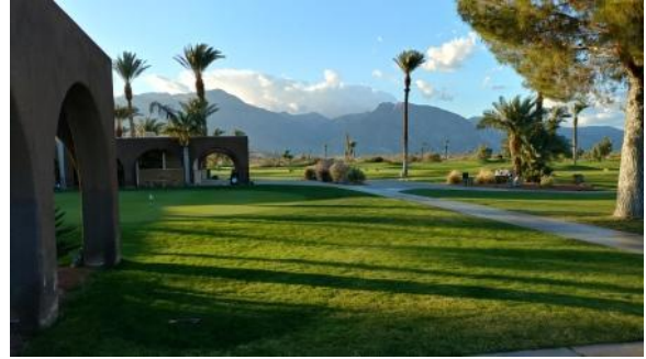
Spectacular views surround the Borrego Springs Resort and Spa.