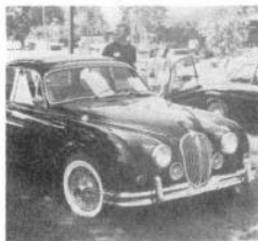
A good looking 420 Saloon