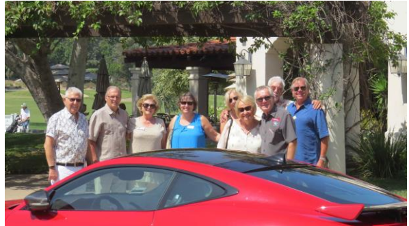
Some of the attendees at that Concours Afterglow Luncheon at the Rancho Santa Fe Golf Club