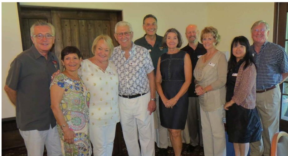
Raffle Prize winners