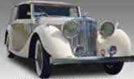
1948 Jaguar Mark IV VIN: 517063