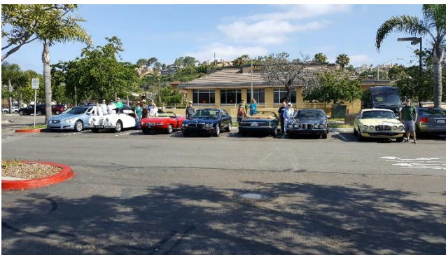
The Start - We Look Marvelous