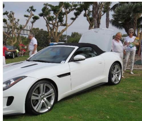
A Happy Nedra Rummell with Connie Noble by Nedra's '14 F-Type S