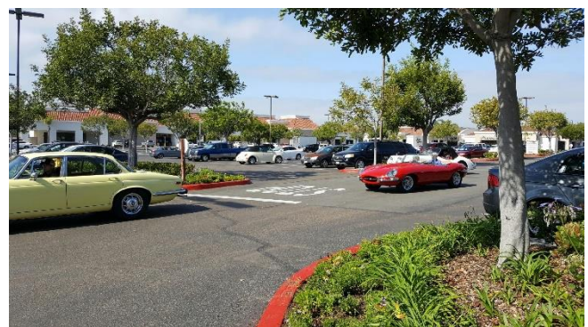
Head 'Em Up, Move 'Em Out