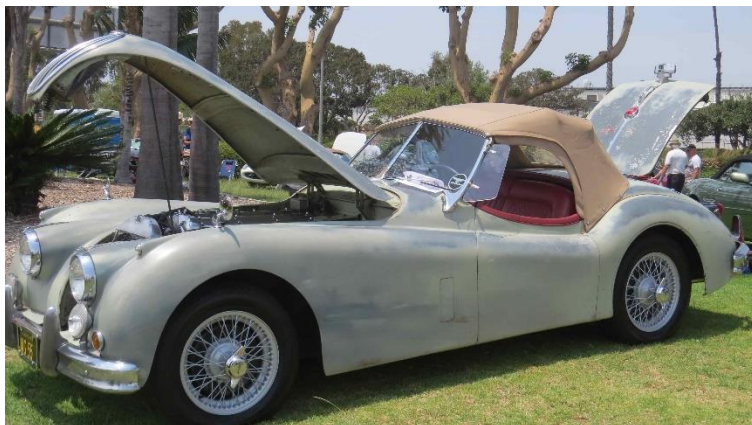
Louie Silva's Unrestored '55 XK140