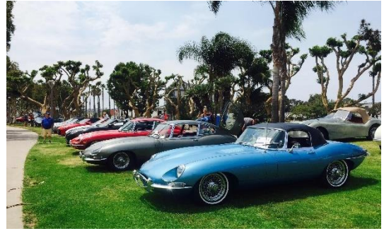
Entrance to the field at the 53 rd SDJC Concours at Spanish Landing