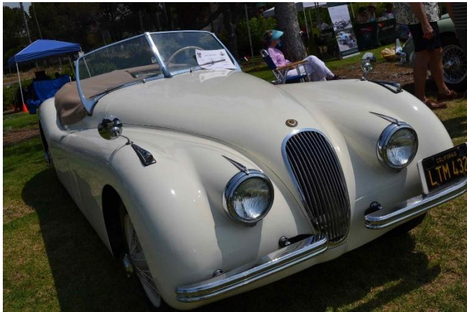
Dick Cavicke's '52 XK120 SE