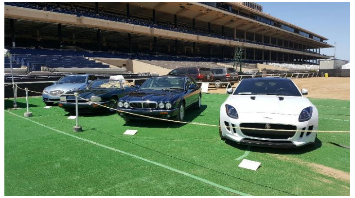
The Display Area