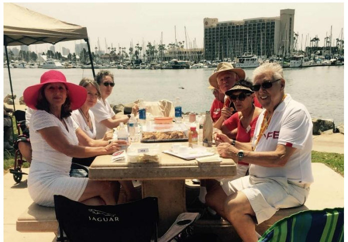
A Break for Lunch