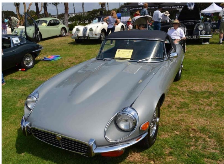
Craig and Sue Turner's '74 E-Type OTS