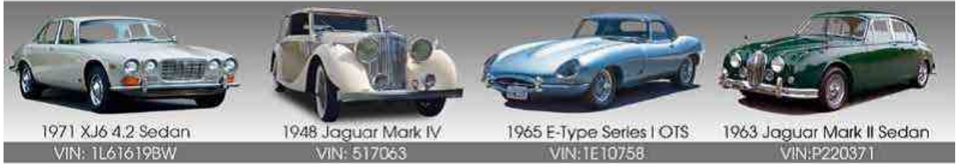
1971 XJ6 4.2 Sedan VIN: 1L61619BW