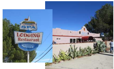
Jacumba Hot Springs Spa