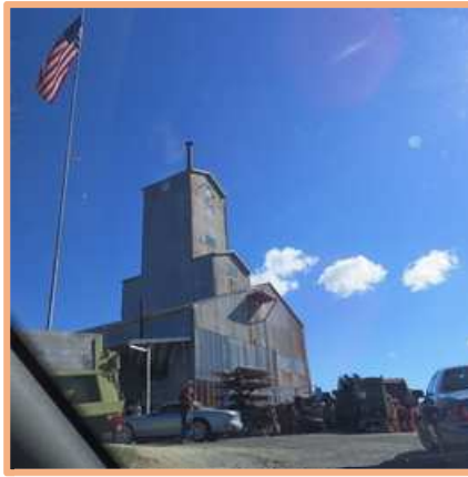
Site of the Motor Transport Museum in an old Feldspar Mill