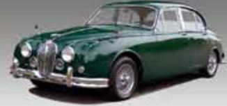
1963 Jaguar Mark II Sedan VIN: P220371

To providing unparalleled dedication, service & experiences for collectors for over 30 years,