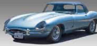
1965 E-Type Series I OTS VIN: 1E10758