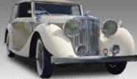
1948 Jaguar Mark IV VIN: 517063