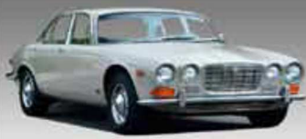
1971 XJ6 4.2 Sedan VIN: 1L61619BW