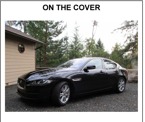
2017 XE