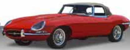
1966 E-Type Series 1 4.2 OTS VIN: 1E11887