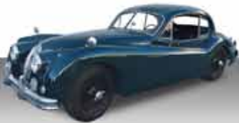
1956 XK-140 SE 3.4 FHC VIN: A815713

A diverse selection of classic Jaguar examples available now.