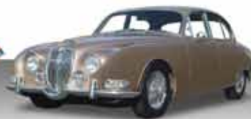
1967 S-Type 3.8 Sedan VIN: PIB78902BW