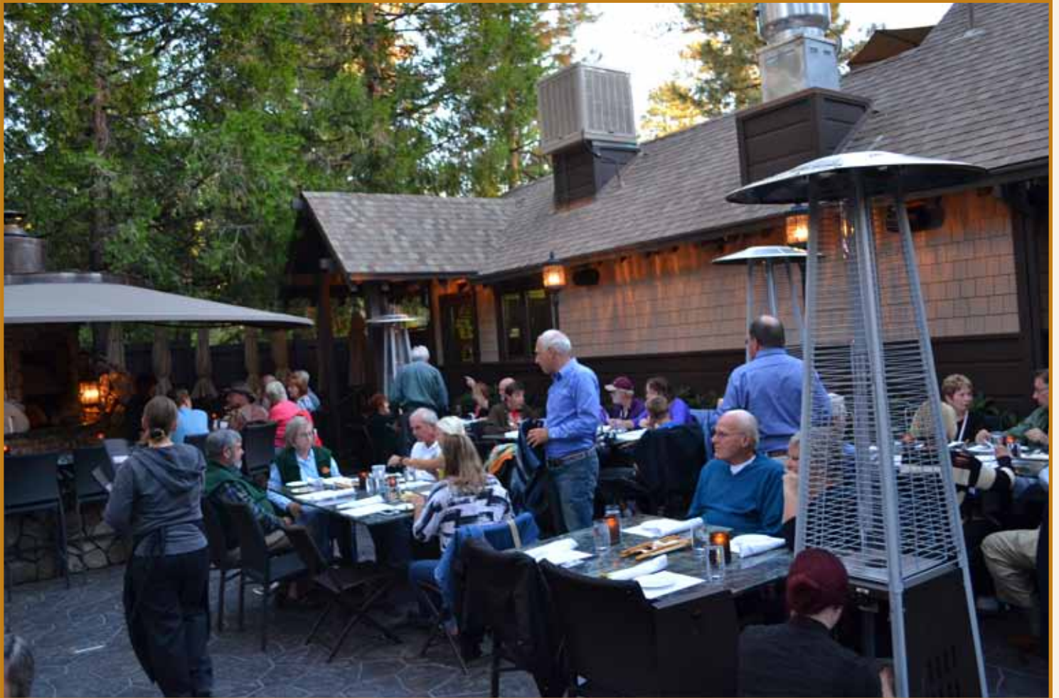
IEJC, JOC LA and SDJC members enjoy the patio in the pines; a beautiful setting for a Concours!