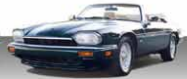
1994 XJS 2+2 Convertible VIN: SAJNX2740RC191230