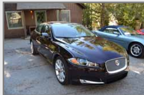
Dave Allen’s 2015 XF Porfolio