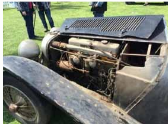
'36 Jaguar SS-100 "barn find"