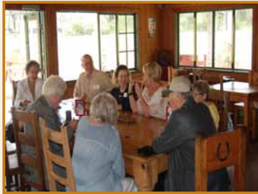
Early attendees get the early pies