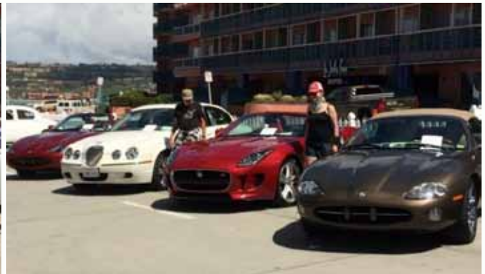
SDJC, JOCLA, and IEJC member cars on display