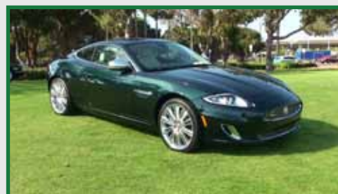
2014 Jaguar XK Coupe belonging to the Editor