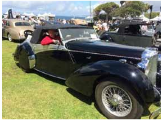
The author in the Harding's Lagonda