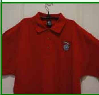
Polo Shirts $25 Call for Colors