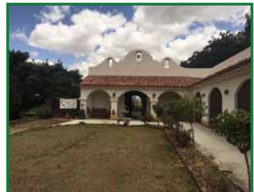
Entrance to the Hacienda de las Rosas Winery