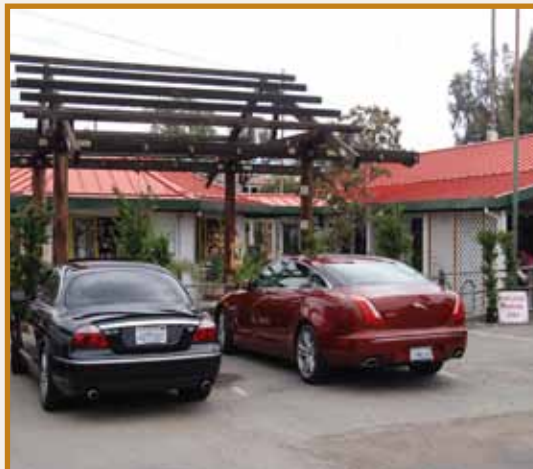
Members' Jags line up outside Betty's Pies