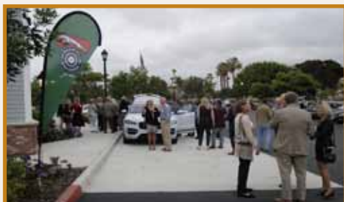
Members look over the new Jaguar F-Pace.