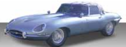
1967 E-TYPE SERIES 1 3.8 OTS VIN: 1E14718