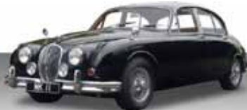
1963 MK2 3.8L SEDAN VIN: P218707DN