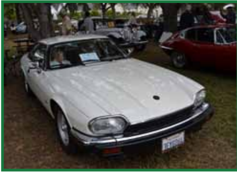
Chuck & Kathy Leuthen's 1993 XJS

Before "Rags Down" was called, Dev and I worked hard cleaning our XF. The car is always garaged, but last night she was outside in the Hilton parking lot. I had made sure to park away from all the other cars so as not to get any door dings, so I parked way out back next to a planter. It didn't dawn on me the planter sprinklers might go on during the night. Well they did and the whole front of our car was covered with water spots the next morning. Aaarg! I got most of the water spots and Dev went over my work, wiping off all the ones I missed. Young eyes are always the keenest. After "Rags Down" was called, our car was in the first time slot for judging, so afterwards there was plenty of time to mingle and catch up with the current happenings of old friends.