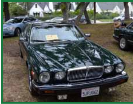
Paul Novak's 1990 XJ12 VDP