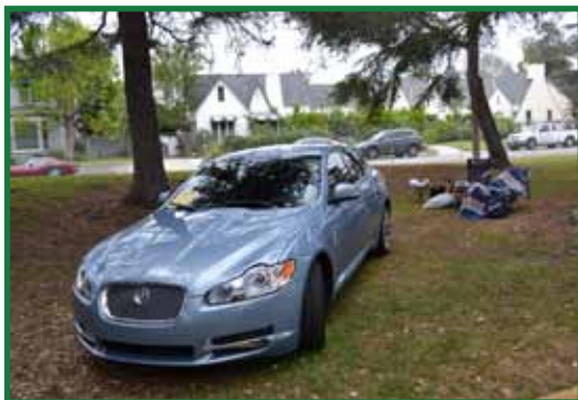
The author's 2009 Jaguar XF Saloon