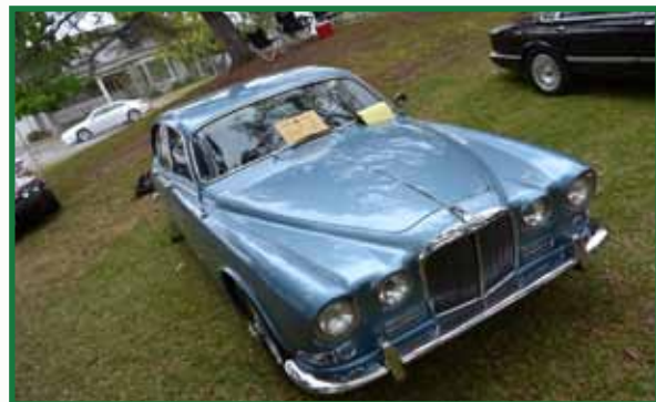
Tom Krefetz' 1967 420 Saloon