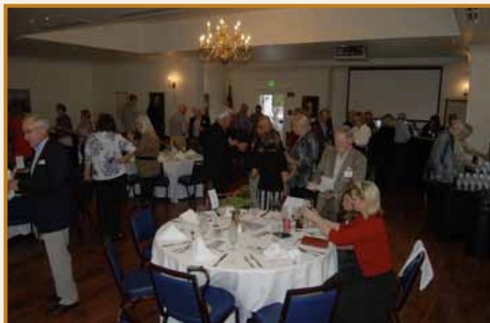
Great turnout for New Member Night!