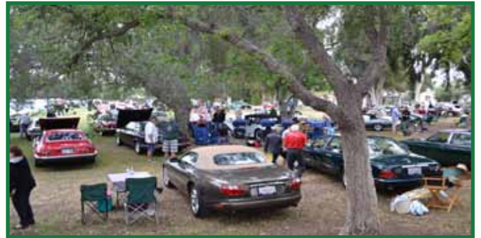
... we got it 'made in the shade'.

When we arrived, the Muckenthaler grounds were full of beautifully kept and restored cars from all era's and geographic areas. There were American and foreign cars dating all the way back to the 1920's, the 1930's, and 1940's. There were lots of big 1950's American sedans and 1960's American muscle cars. There were also exotic foreign makes, including our Jags.