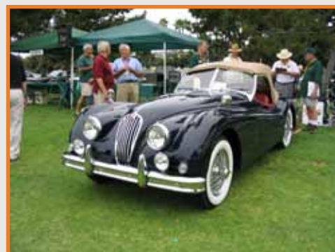
From SDJC Concours, 2004