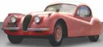
1953 XK-120 3.4L FHC VIN: 680278

A diverse selection of classic Jaguar examples available now.