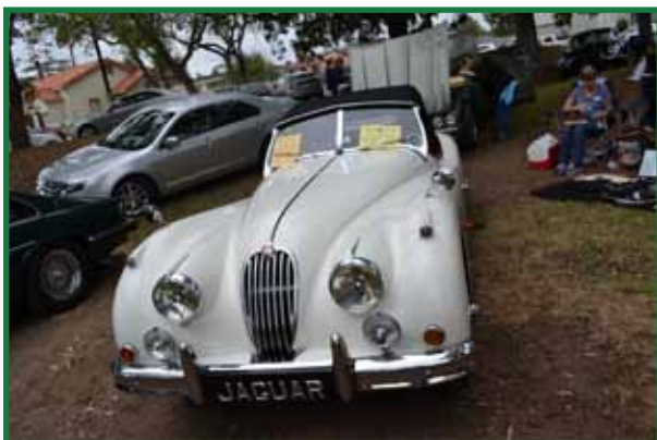
Bob & Diane Detro's 1955 XK140 SE

Our Jags had their own corral area and we were free to view all the other cars while enjoying the many amenities of the Muckenthaler show. We had the tree lined area so our Jags had just enough shade to keep them cool but not too much to interfere with the viewing. It was just another beautiful and relaxing day.