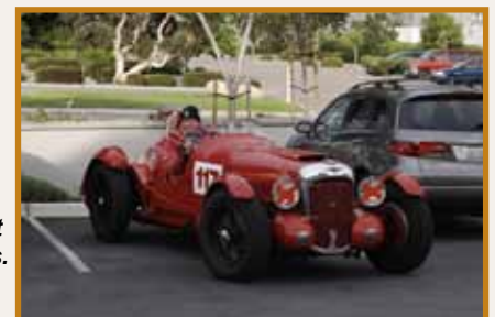
The Hardings brought one of their Lagondas.