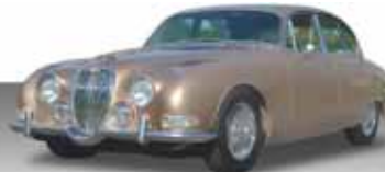
1967 S TYPE 3.8L SEDAN VIN: PIB78902BW