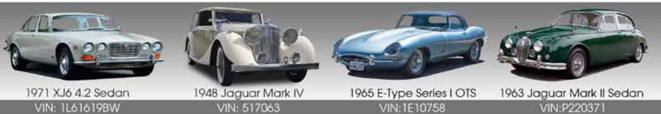
1971 XJ6 4.2 Sedan VIN: 1L61619BW