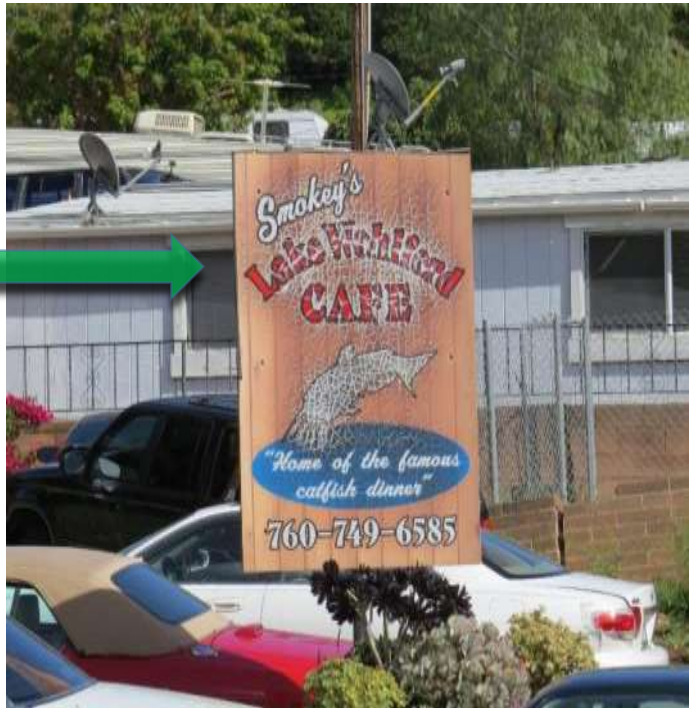
Great food at Smokey's