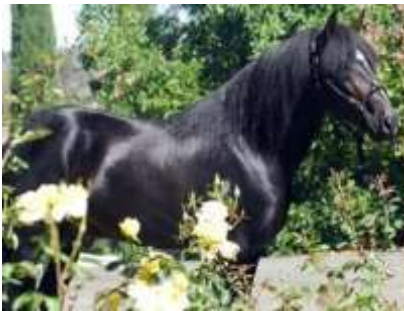
Peruvian Paso horse bred on the grounds of the winery

Starting location: Scripps Ranch Marketplace 10555 Scripps Poway Pkwy, San Diego.