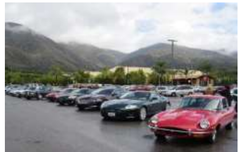
Rest stop at Casino Pauma