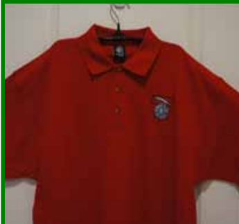
Polo Shirts $25 Call for Colors