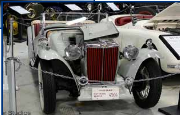
Some of the cars you may see at ‘The British Invasion’.

The following page contains a map of the Park with the locations of some of the attractions. Special note is made of the Automotive and Air and Space Museums. Information about parking lots and tram service is also noted.