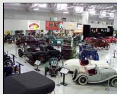
The Exhibit Floor of the San Diego Automotive Museum