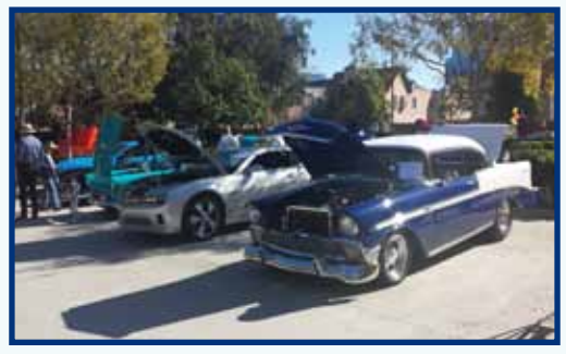
Hot rods and muscle cars