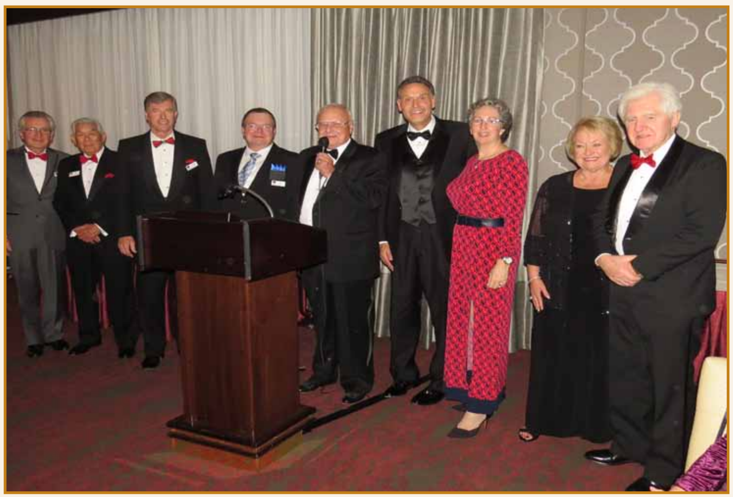
Installation of Officers for 2016