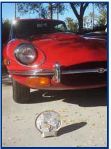
Proctor's E-Type with trophy