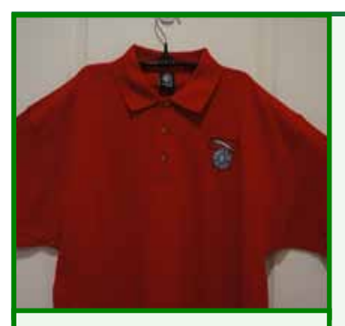
Polo Shirts $25 Call for Colors