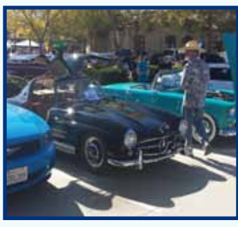
Best in Show Mercedes 300 SL