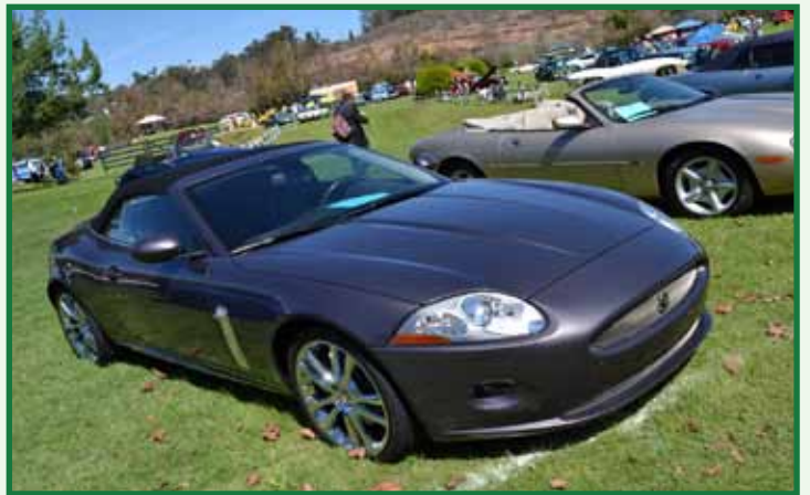
Dan & Luz Culp brought their 2008 XK Convertible.