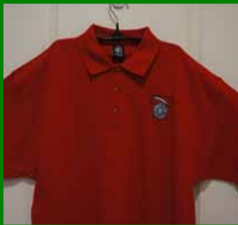
Polo Shirts $25 Call for Colors