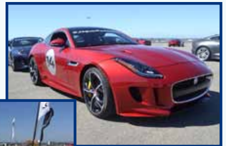
'Hot' F-Types on the track at the Festival of Speed.

Jaguar's highly-visible presence this year is part of their expanding involvement in vintage car racing. This is being coupled with very exciting rides/drives in new, four-wheel-drive, 550 HP F Type R coupes as part of the Jaguar Performance