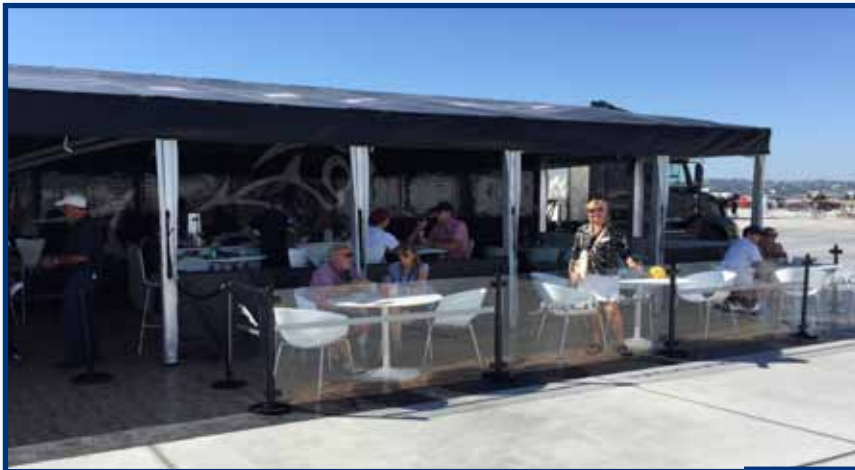
Jaguar's Hospitality Suite was a popular place to cool off.