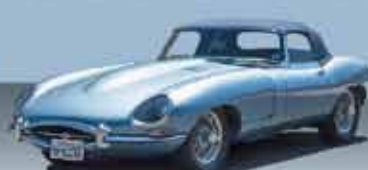
1965 E-Type Series I 4.2 OTS VIN: 1E10758