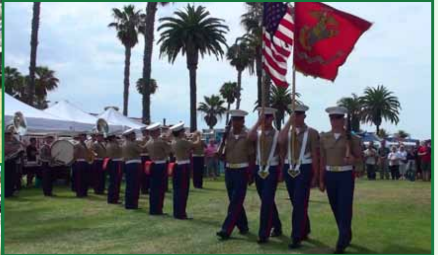
The Marines Retire the Colors on a spectacular day!