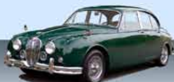
1963 Mark II 3.8 Sedan VIN: P220371