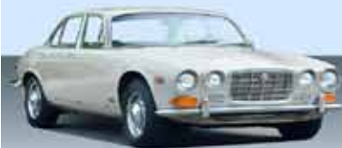
1971 XJ6 4.2 Sedan VIN: 1L61619BW