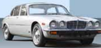
1977 XJ6L Series II Sedan VIN: UH2T68003BW