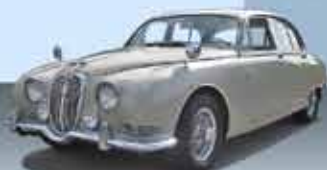
1964 S-Type 3.8 Sedan VIN: P1B75074DN