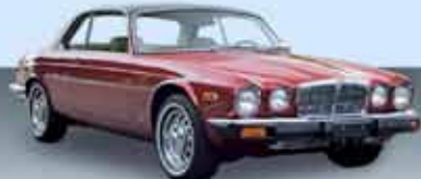
1977 XJ6C Sports Coupe VIN: VH2J53738