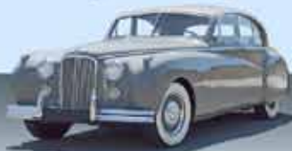
1954 Mark VII 3.4 Saloon VIN: 736352BW

Unique Jaguar Inventory available now from CLASSIC SHOWCASE