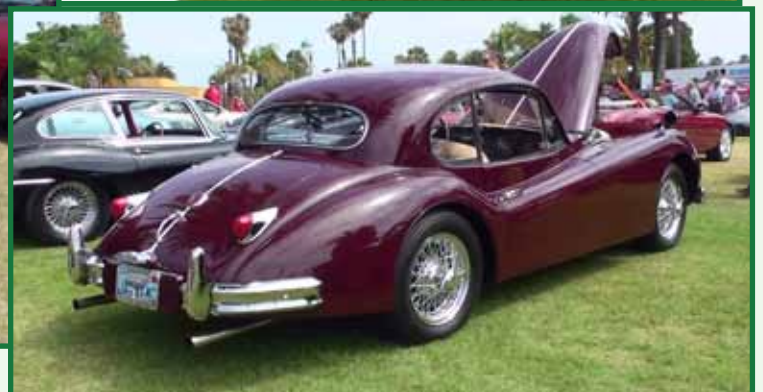
Beautiful Jaguars on the show field!