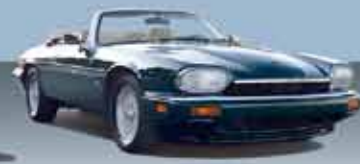
1994 XJS 2+2 Convertible VIN: SAJNX2740RC191230