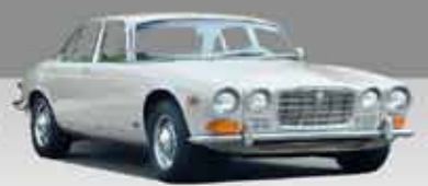
1971 XJ6 4.2 Sedan VIN: 1L61619BW