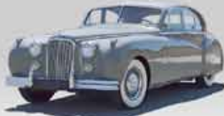
1954 Mark VII 3.4 Saloon VIN: 736352BW