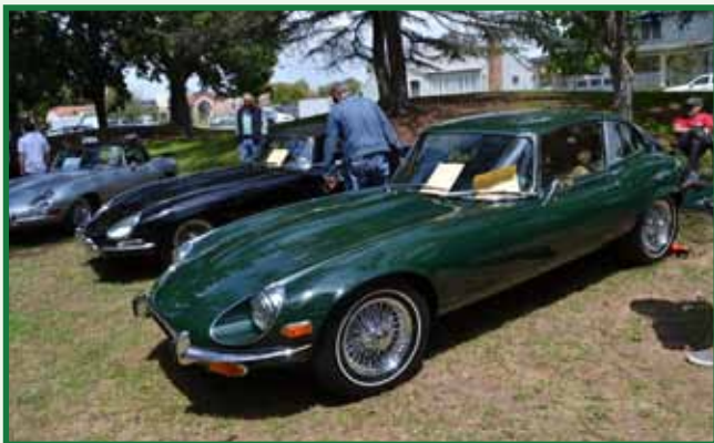
Tom Krefetz's 1971 E-Type V12 2+2 Coupe.

We had the tree lined area so our Jag's had just enough shade to keep them cool but not too much to interfere with the viewing. It was just another beautiful and relaxing day. Even the drive up the I-5 was stress free. It was my first show of the year, and boy, was it a doozie. After "Rags Down" was called, there was plenty of time to mingle and catch up with the current happenings of old friends. There were thirty-three judged Jaguar cars in the Concours: 19 Champion and 14 Driven.