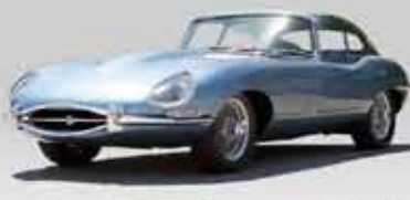
1966 E-Type Series I 4.2 OTS VIN: 1E31482