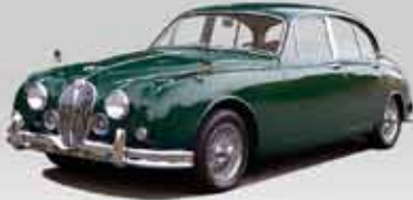
1963 Mark II 3.8 Sedan VIN: P220371