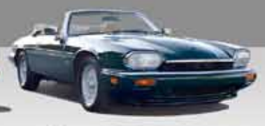
1994 XJS 2+2 Convertible VIN: SAJNX2740RC191230