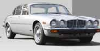
1977 XJ6L Series II Sedan VIN: UH2T68003BW