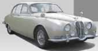
1964 S-Type 3.8 Sedan VIN: P1B76074DN