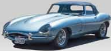
1965 E-Type Series I 4.2 OTS VIN: 1E10758

Unique Jaguar Inventory available now from CLASSIC SHOWCASE