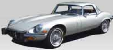
1974 E-Type Series III V12 OTS VIN: UE1S26Q55