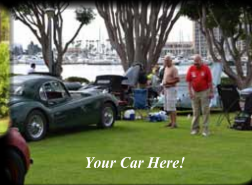
Your Car Here!