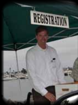
The Chairman wants you!

The 50th Was Fantastic! Now, Onward to the 51st!