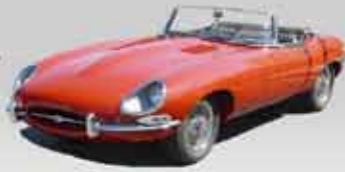
1966 E-Type Series II 4.2 OTS VIN: 1E11887