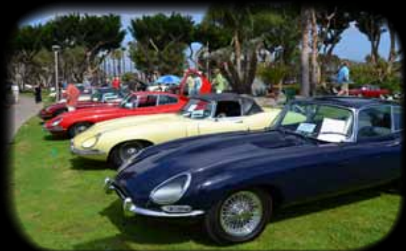
The E-Types are gathering!