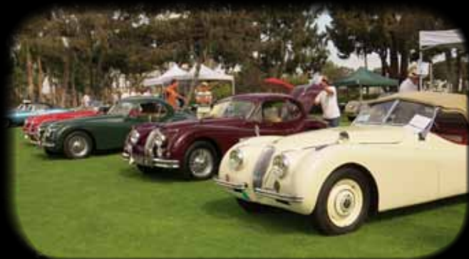
The XKs are preparing!