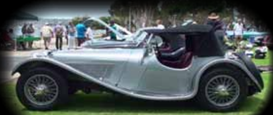
Can they repeat?