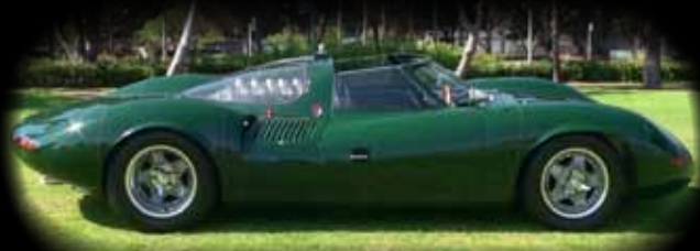
The President has a parking place for you!