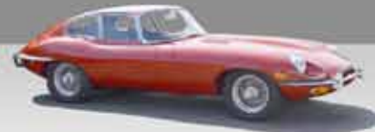
1969 E-Type Series II 4.2 FHC VIN: 1R25773