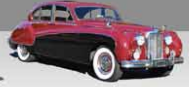
1959 Mark IX 3.8 Sedan VIN: P79D925BW