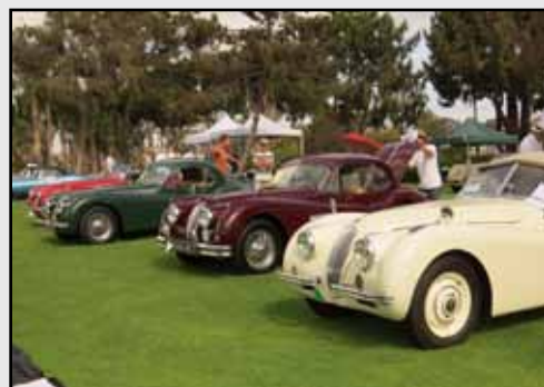
Jaguar XK 120s and 140s on display at the 2014 SDJC 50th Anniversary Concours