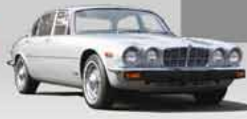
1977 XJ6L Series II Sedan VIN: UH2T68003BW