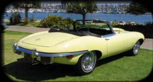
... old roadsters ...