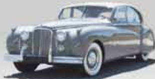
1959 Mark VII 3.4 Saloon VIN: 736352BW