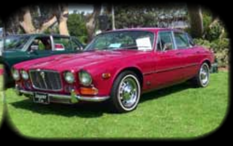
The saloons are coming!