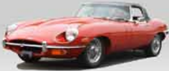
1969 E-Type Series II 4.2 OTS VIN: 1R7547