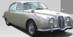
1964 S-Type 3.8 Sedan VIN: P1B76074DN