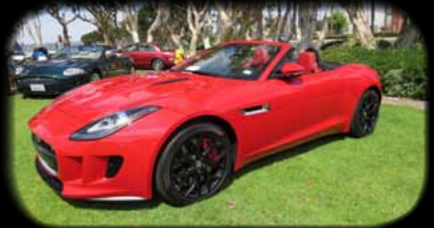
... and new roadsters ...