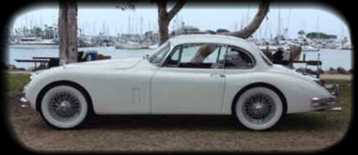
... and old coupes ...