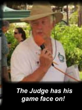
The Judge has his game face on!