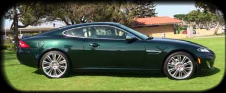
There are new coupes ...