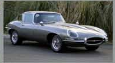
1966 XKE SERIES I 4.2 FHC VIN: 1E32782