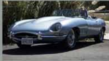
1965 XKE SERIES 1 4.2 OTS VIN: 1E10758