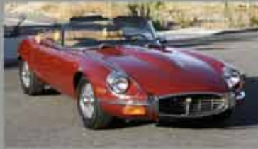
1973 XKE SERIES 3 5.3 V12 OTS VIN: UD1S21141