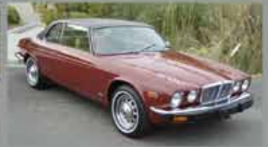
1977 XJ6C SPORTS COUPE VIN: VH2J53738