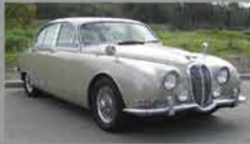
1964 S TYPE 3.8 SEDAN VIN: P1B75074DN