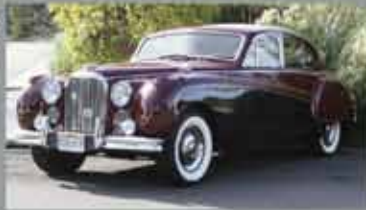
1959 MARK IX 3.8 SEDAN VIN: P7909258W