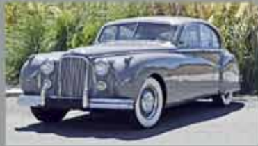
1954 MK VII SALOON VIN: 7363528W