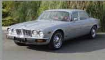
1977 XJ6L SERIES II 4.2 SEDAN VIN: UH2T680038W