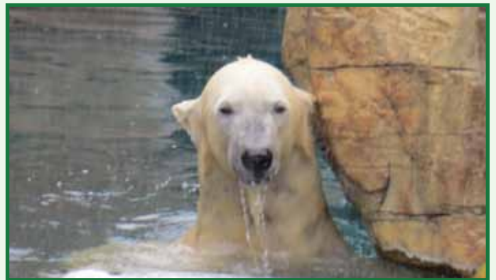
“Hi, everyone ... Glad you could make it!”

We also got to be up close and personal with some beautiful lions next door who, as we learned, might be called “King of the Jungle” but don’t actually live in the jungles and tigers (that do) are actually larger. After touring the park we were ushered to the thankfully warm and dry Rondavel Room for a mini meeting with a couple of cuddly critters and an armadillo who patiently let members give a pat or two.