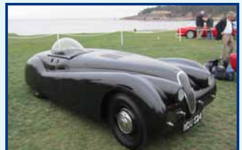
1952 Jaguar XK 120 land speed record car.