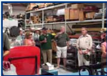
The upholstery trim shop