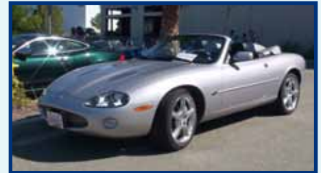
Reg and Joy L'Abbe's 2001 Silverstone XK8