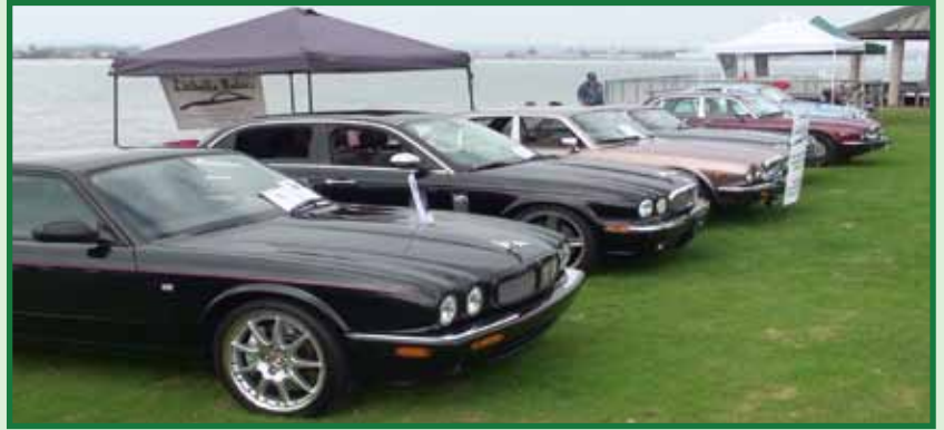
A variety of Jaguar saloons on the show field.