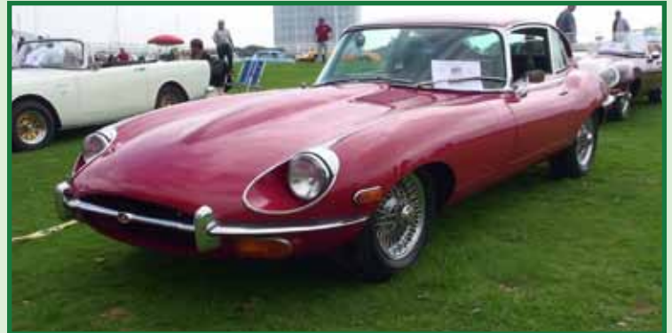
Bob and Ali Proctor's 1969 Jaguar E-Type 2+2 Coupe.