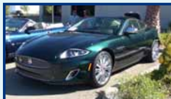
Jim Hallameyer's 2014 XK Coupe