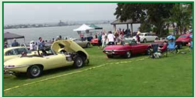
The San Diego Jaguar Club spread out on a prime show location by the Bay.