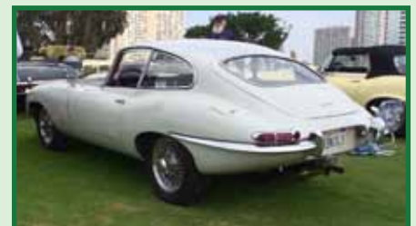
Colin Bennett's Series I E-Type Coupe.