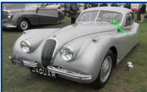
1951 Jaguar XK 120 Prototype

The car won Best in Class – Postwar Sports Racing, and The Montagu of Beaulieu Trophy for the most significant car of British origin in attendance.