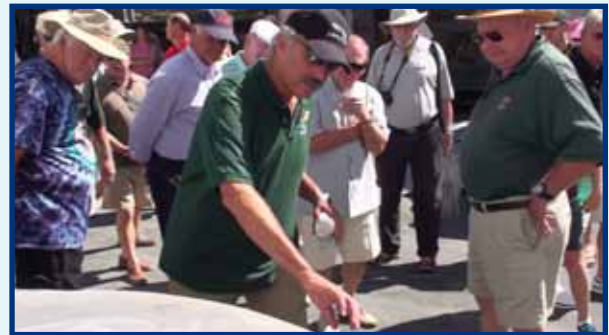
... and explains metal work needed on another