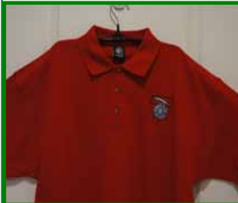
Polo Shirts $25 Call for Colors