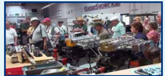
... while members listen