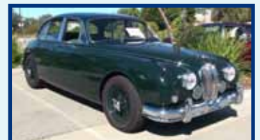
A very attractive 3.8 Saloon