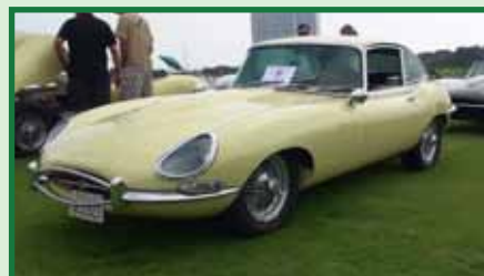
Walt Lima's 1967 E-Type 2+2.