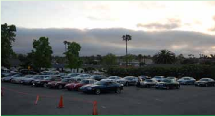
Parking reserved for Jaguars only!