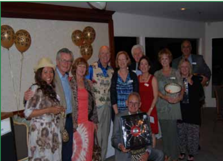
Lucky raffle winners!