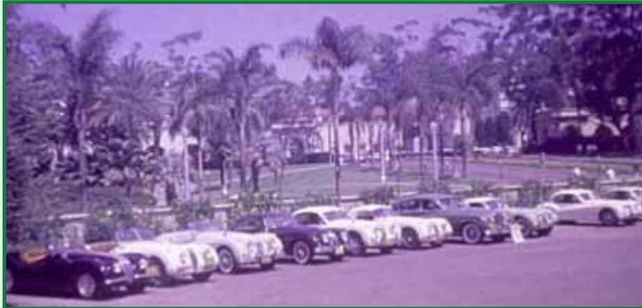
The first show of the San Diego Jaguar Club was held in 1959 in Balboa Park, San Diego, California. Our first Concours d'Elegance, sanctioned by Jaguar Clubs of North America, was held in 1964.