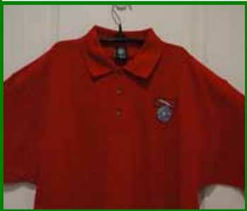
Polo Shirts $25 Call for Colors