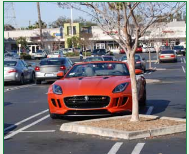
Kurt Astroth's new F-Type ready to go.