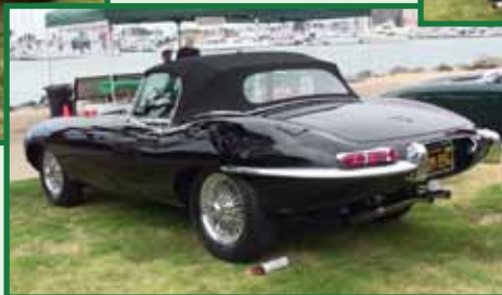
From the 2011 Concours: An impeccably restored 1966 Jaguar E-Type OTS helps us celebrate the 50th Anniversary of the E-Type; one of the most beautiful cars ever produced.