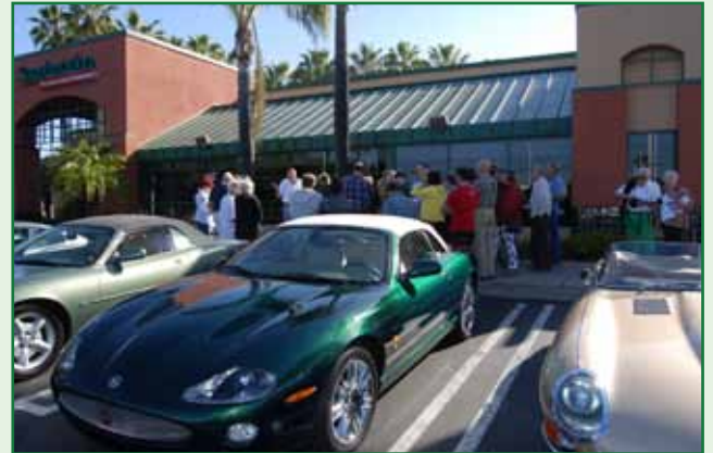
Members gather for coffee and conversation.