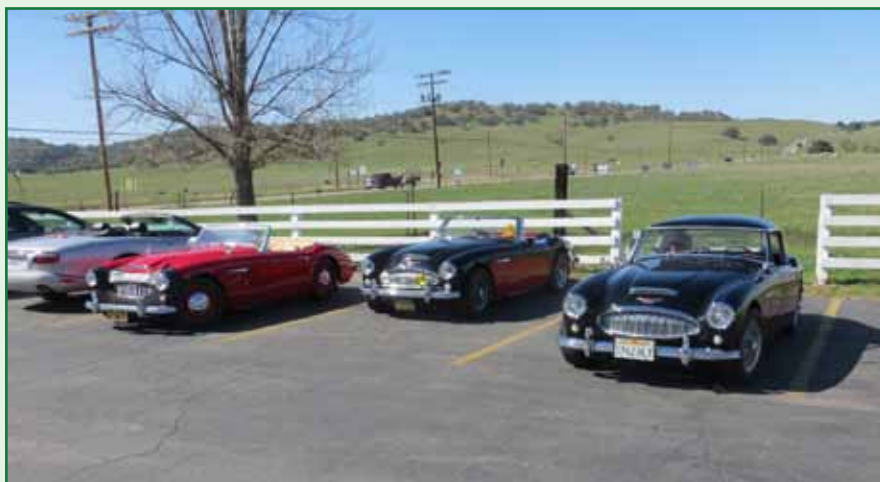
We crossed paths with The Austin Healey Club at Dudley's Bakery.