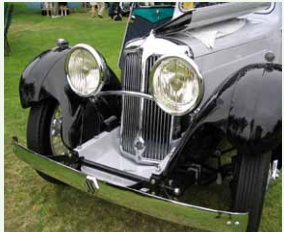
1932 SS1 Coupe