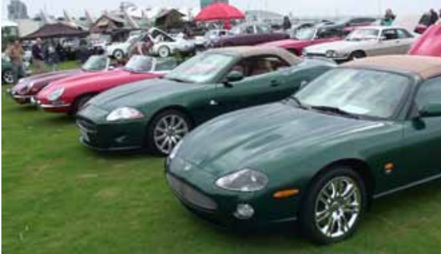
Jaguars on the field at SDBCC