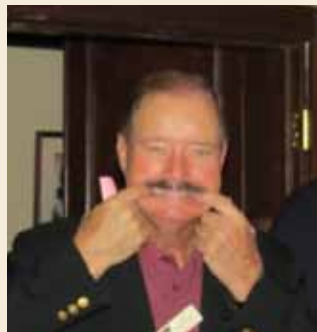
Every village should have at least two of these!