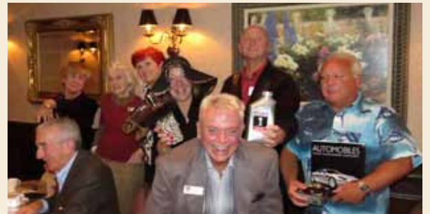
Lucky raffle winners.