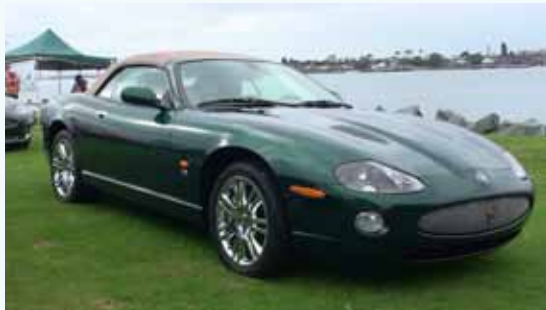
Vic Chang's XK8 convertible