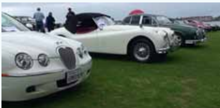
Jags by the 'Big Bay'

Twenty-seven Jaguars joined over 220 British Cars at the annual British Car Day Show sponsored by the San Diego British Car Club Council. This year's event was held in downtown San Diego at the beautiful Embarcadero Marina Park North. With unobstructed views of San Diego Bay, the park was the perfect location for our Jaguars to be viewed in all their British glory.