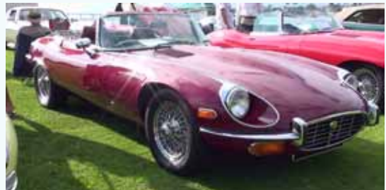
Grant Rummell's 1972 E-Type OTS