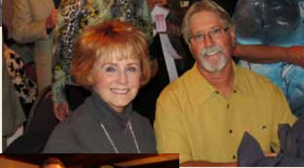
'Girls just wanna have fun!'