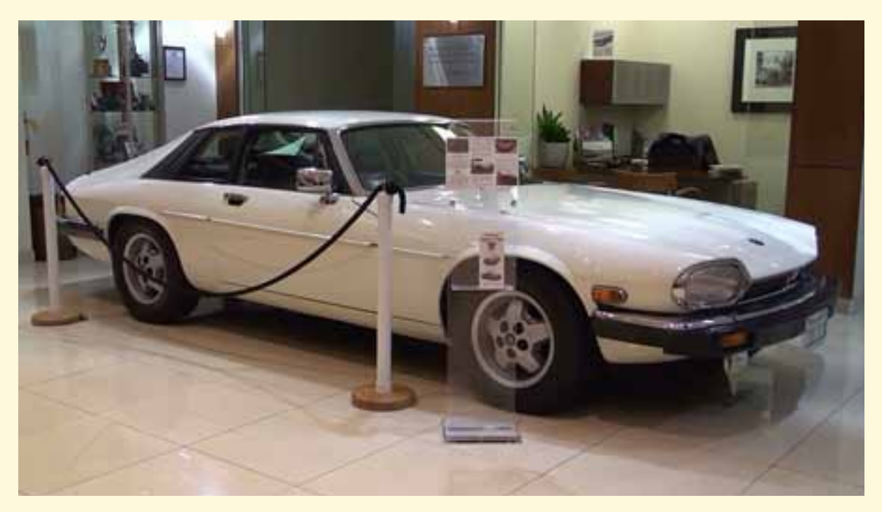
1988 Jaguar XJS Coupe

The Jaguar XJS is a luxury grand tourer produced by the British manufacturer, Jaguar, from 1975 to 1996. The XJS was based on the XJ saloon platform and replaced the E-Type in September of 1975. It had been developed as the XK-F, though it was very different in character from its predecessor. Although it never had quite the same sporting image, the XJ-S was a competent grand tourer, and more aerodynamic than the E-Type. The last XJS was produced on April 4, 1996. 115,413 had been produced during a 21-year production life. The model was replaced by the XK8.