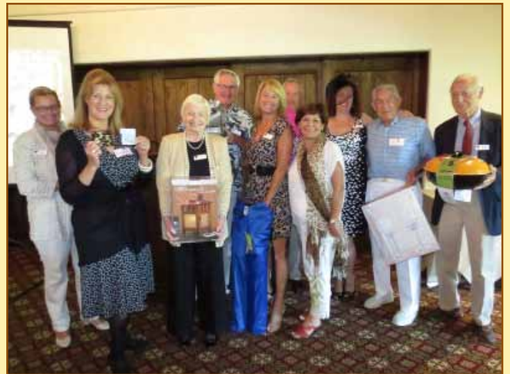
Lucky raffle winners!