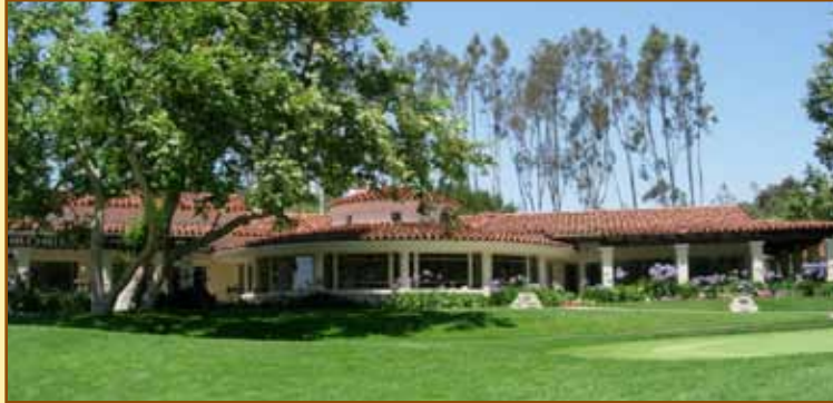
What a beautiful setting to celebrate this year's very successful 49th Concours d'Elegance!