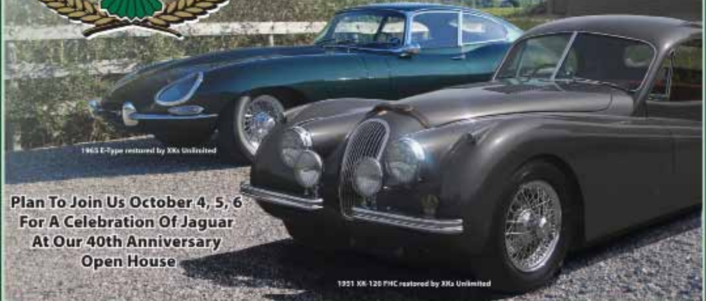
1963 E-Type restored by XKs Unlimited