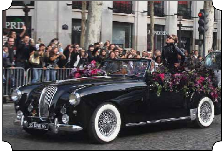
Lady Gaga. What can I say?