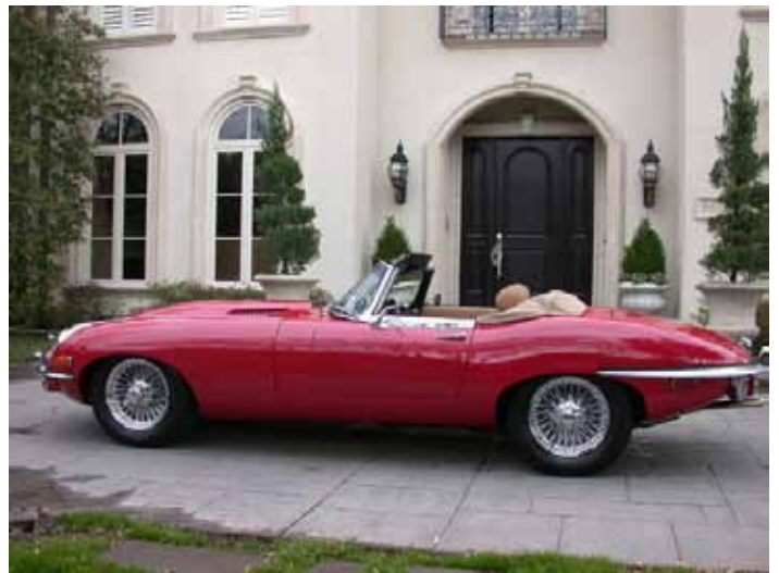
In Your Dreams!