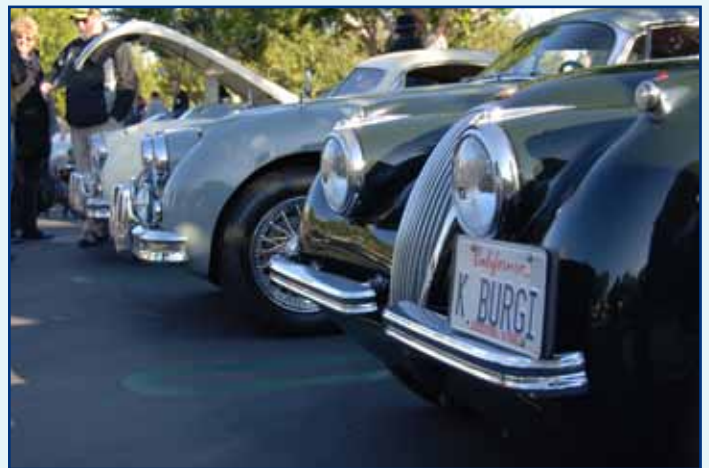
Classic Jaguars lined up