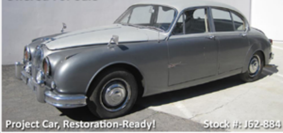
Project Car, Restoration-Ready!