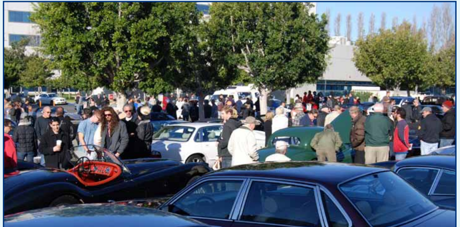
Good showing of "cats" in the Jaguar corral at Cars and Coffee