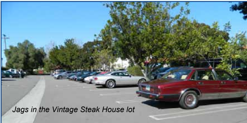
Jags in the Vintage Steak House lot