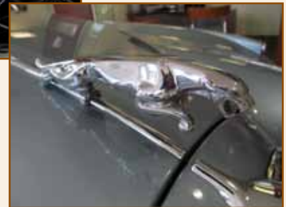
Ours is bigger