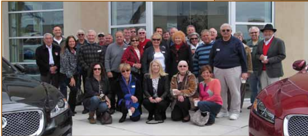
From top to bottom - Our gang in front of the dealership. The brand new Jaguar F-Type. Our Club display car. Our gang up close.