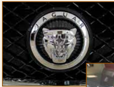
The dealership's Leaper