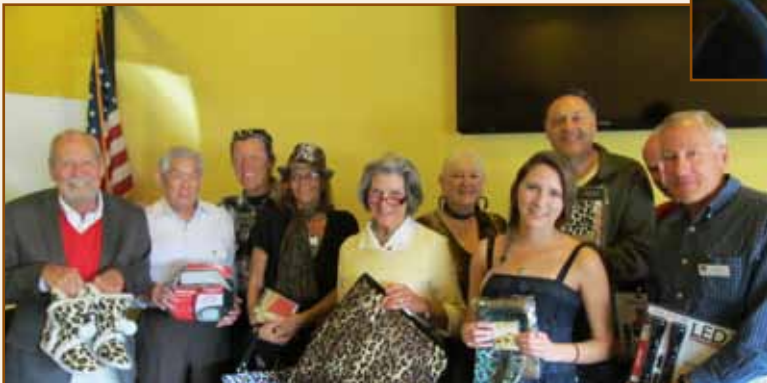
Lucky Raffle Winners!