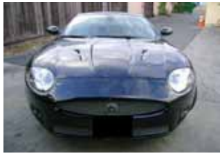
J A G U A R