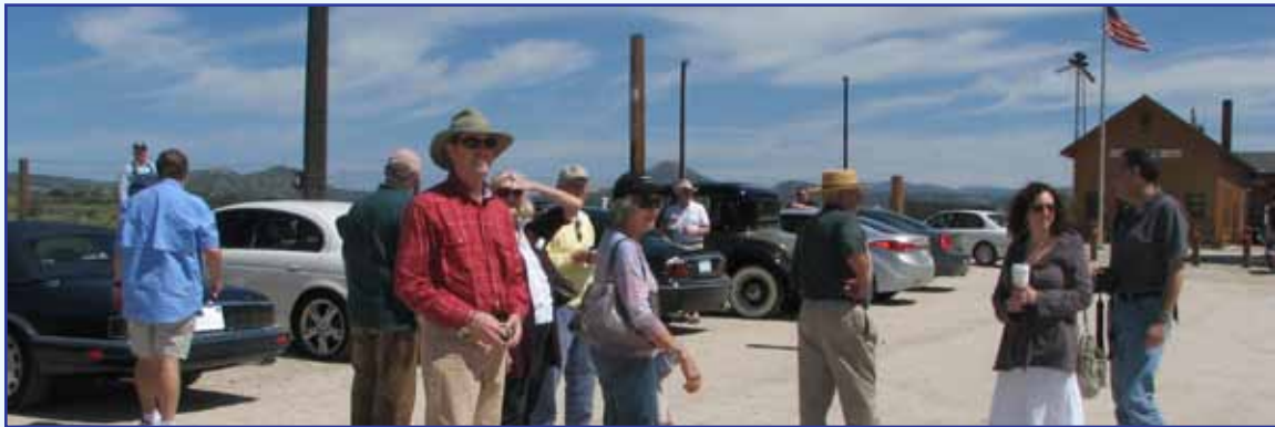
Milling about smartly on arrival in Campo

We had glorious weather and a wonderful drive! The group stuck together this time -- and thoroughly enjoyed it! All the pristine jags-in-a-row with the sun gleaming off their shiny finishes navigating the twisting turning roads! Finally we all took the turn to the train station and wildly kicked up as much dust as possible on the long dirt road! It was Cats