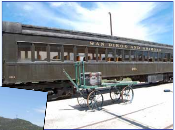
The Coach Car