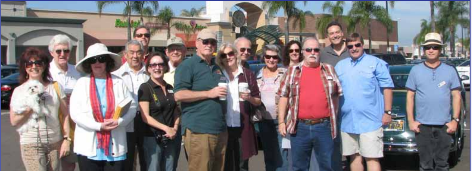
Jaguaventurers muster for the drive