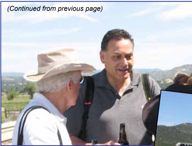
Al Steele and Bob Proctor