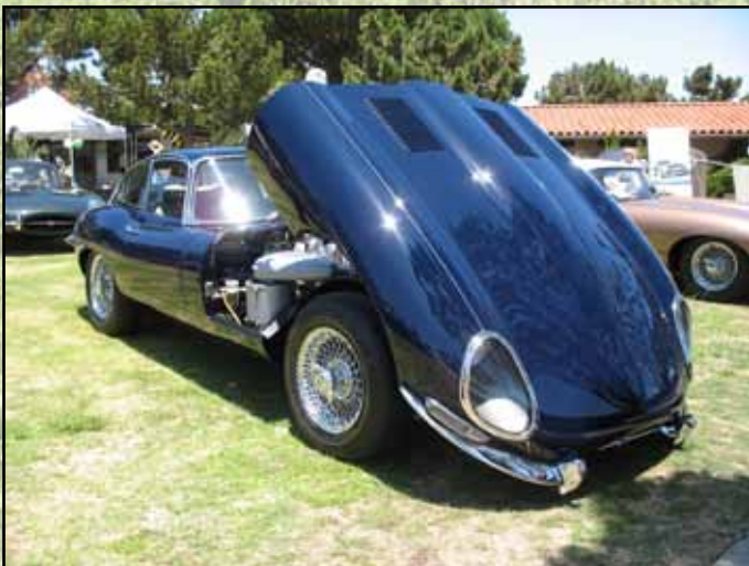
Ken Lamon's 1965 Coupe