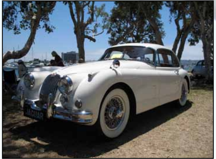
Mitch Cohen's 1959 XK 150 Coupe (1st place D01)