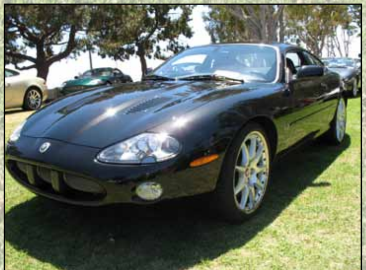
Bill Woolley's 2002 XKR 100 (2nd place D09A)