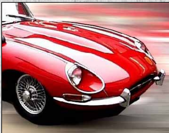
The classic E-Type Its 50th Anniversary

Jaguar Tracks is published monthly by the San Diego Jaguar Club as a membership benefit. Please send change of address information to the Membership Chairperson. This includes street address, e-mail address(es), or telephone numbers. The editor reserves the right to edit all material submitted. Reproduction of articles, etc. from other publications requires proper credit, as do articles, etc. from the Jaguar Tracks into other publications. All articles, photographs, ads, etc. for inclusion into the Jaguar Tracks must be received by the newsletter editor by the 15th of the preceding month of publication. Electronic camera ready copy can be sent via CD or e-mail. Preferred formats include Word Perfect, MS Word, MS Word Pad, PDF, TIF or JPG. If you wish, you may send a hardcopy page of your ad via snail mail for baseline comparison with the electronic version. Non-digital ads and business cards will be scanned, however the quality is not guaranteed to be as good as the electronic versions.