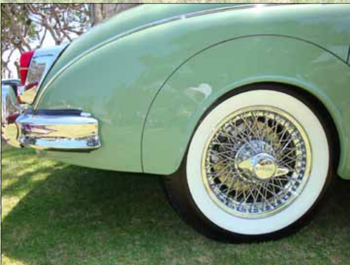
Attention to every detail