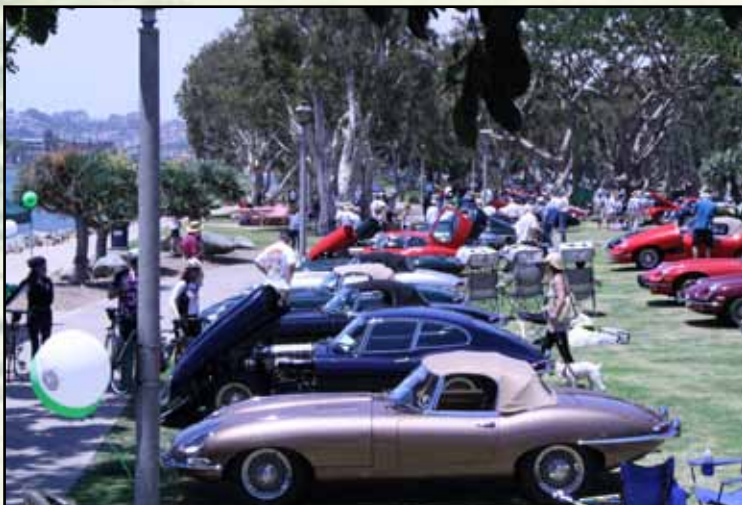
Line of Champion Division E-Types