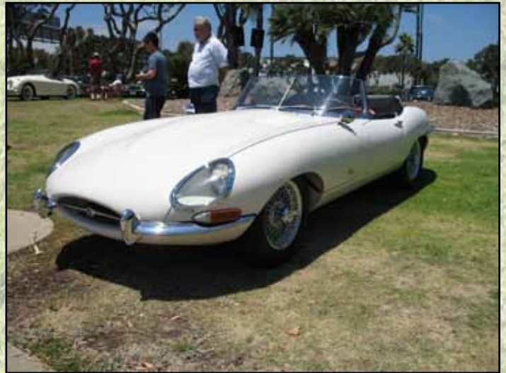
Ian Gill's 1961 Convertible