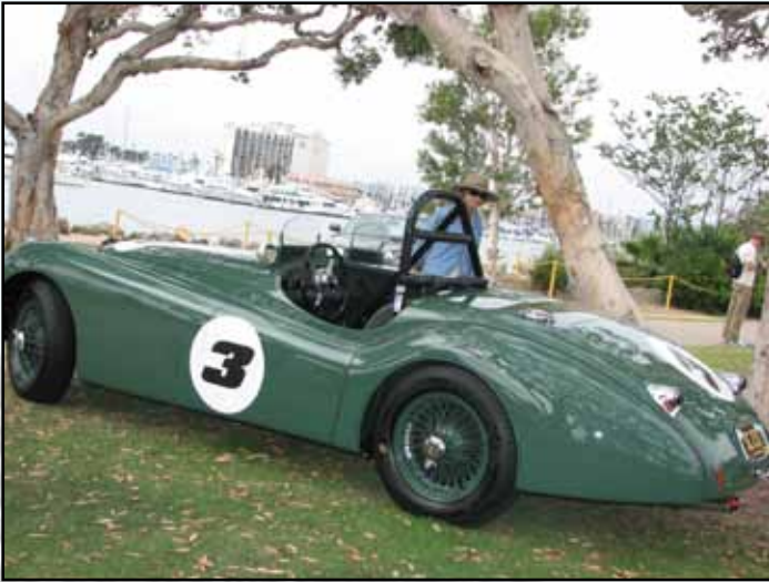
Bill Rooklidge's 1950 XK 120 Racer (1st place S02)