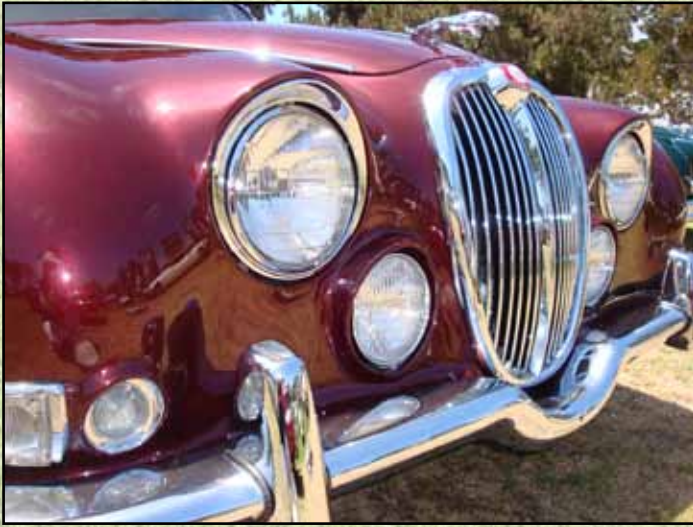
Craig and Sue Turner showed their beautiful 1962 3.8 S for the first time