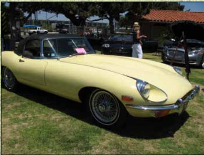
Jim Hallameyer's 1969 Convertible