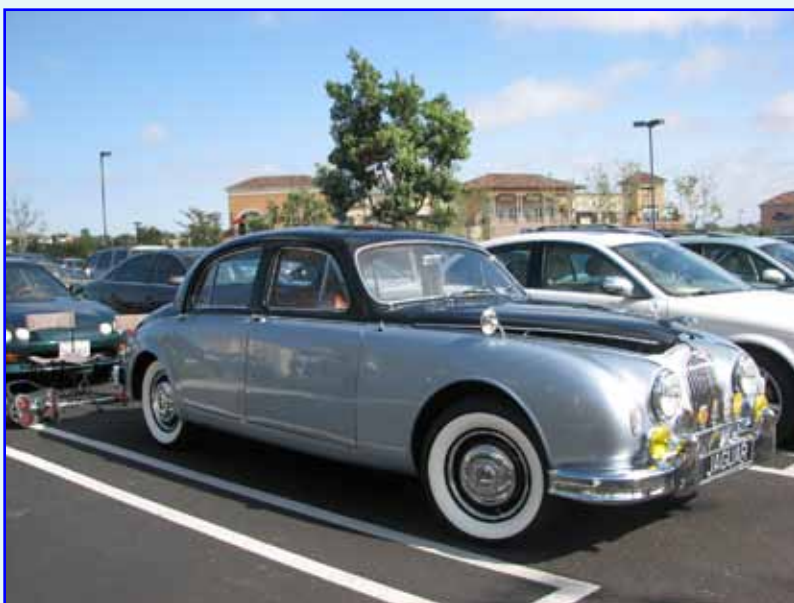
The Norton's MK 1

This year, the display area was much closer to the action. We had 13 Jaguars on display on a sunny and warm evening. Our Jags were all in place by 5:00. We socialized by the cars for a while, then some went shopping and some went to sip wine at the Brigantine.