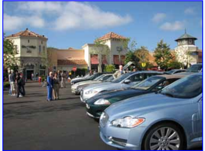
Line of modern Jags