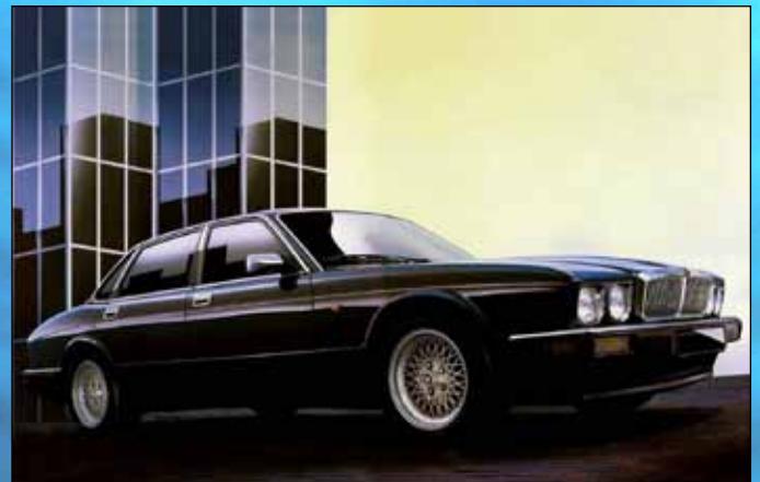
The classic XJ40 in all its glory.

Jaguar Tracks is published monthly by the San Diego Jaguar Club as a membership benefit. Please send change of address information to the Membership Chairperson. This includes street address, e-mail address(es), or telephone numbers. The editor reserves the right to edit all material submitted. Reproduction of articles, etc. from other publications requires proper credit, as do articles, etc. from the Jaguar Tracks into other publications. All articles, photographs, ads, etc. for inclusion into the Jaguar Tracks must be received by the newsletter editor by the 15th of the preceding month of publication. Electronic camera ready copy can be sent via CD or e-mail. Preferred formats include Word Perfect, MS Word, MS Word Pad, PDF, TIF or JPG. If you wish, you may send a hardcopy page of your ad via snail mail for baseline comparison with the electronic version. Non-digital ads and business cards will be scanned, however the quality is not guaranteed to be as good as the electronic versions.