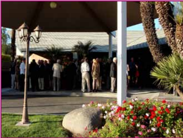
Cocktails outside the Club