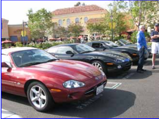
Line of pristine XK8s in the display area