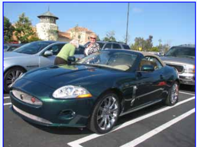
Nedra Rummell with their 2007 XK