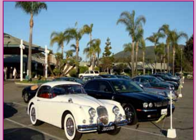
The old lined up with the new on a beautiful spring evening