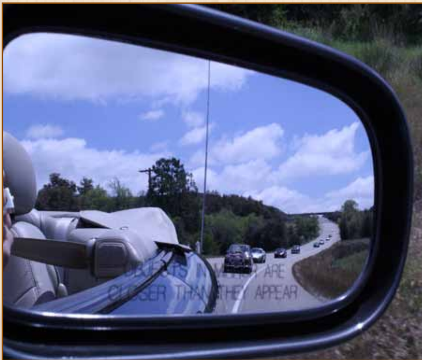
On the way to the restaurant