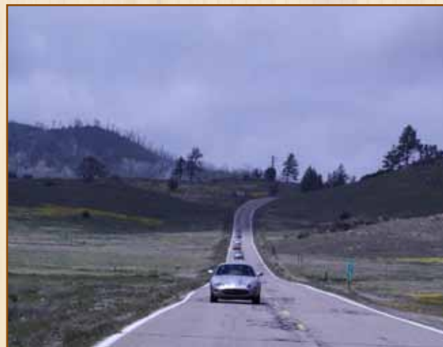
A long line of Jaguars