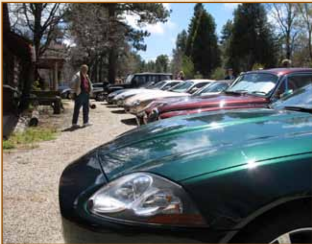
Lined up in front of The Eagle and the Bear