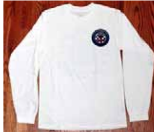
Long Sleeve T-Shirt Front and Back $15