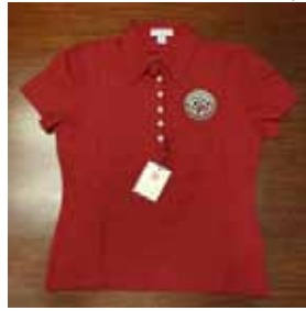
Ladies Polo, $39