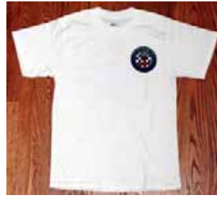
Short Sleeve T-Shirt Front and Back $14