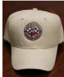
One Size Khaki Cap $15