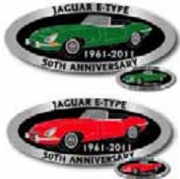
E-Type Car Badges $35 and Pins $5