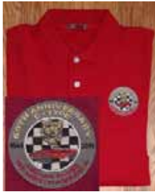
Mens Red Polo $39

The following items can be ordered from JCNA.com/Shoppe , Or by contacting sales@jcna.com , Steve Kennedy, 303-489-3955 Cell, 303-456-5019 Fax, Mountain time