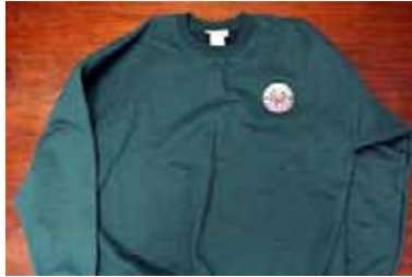
Fleece Sweatshirt, $25