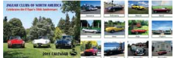
E-Type 50th Anniversary Calendar $12